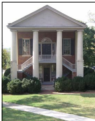
Eumenean Hall, Davidson College Campus

Properties listed in the Register include districts, sites, buildings, structures, and objects that are significant in American history, architecture, archeology, engineering, and culture. The National Register is administered by the National Park Service, which is part of the U.S. Department of the Interior.