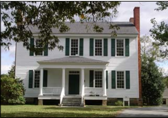
Woodlawn House, Circa 1836