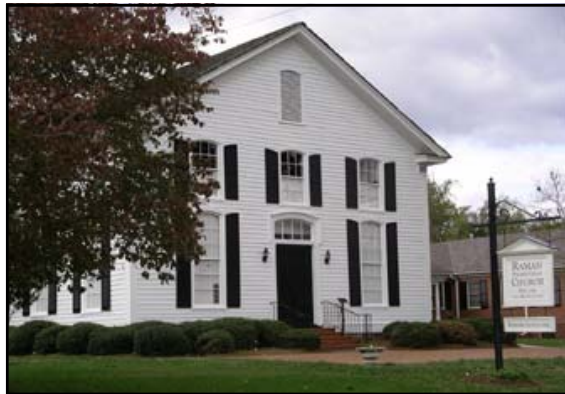
Ramah Presbyterian Church